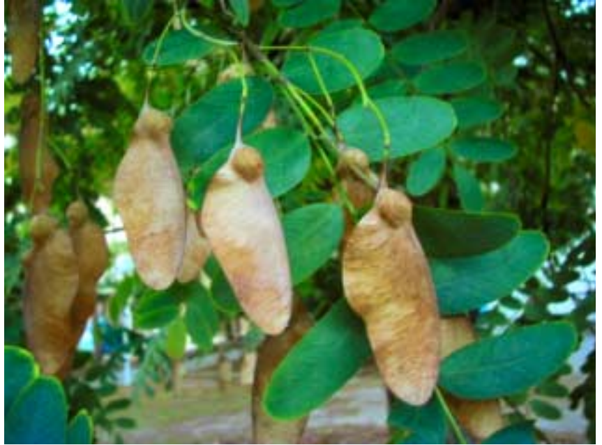
The distinctive winged fruit is sometimes referred to as a 'helicopter', due to its spinning propeller-like action as it falls. The spin is created by the swollen base, which contains one to three seeds.

Map: Base data used in the compilation of distribution map provided by Australian herbaria via Australia's Virtual Herbarium.