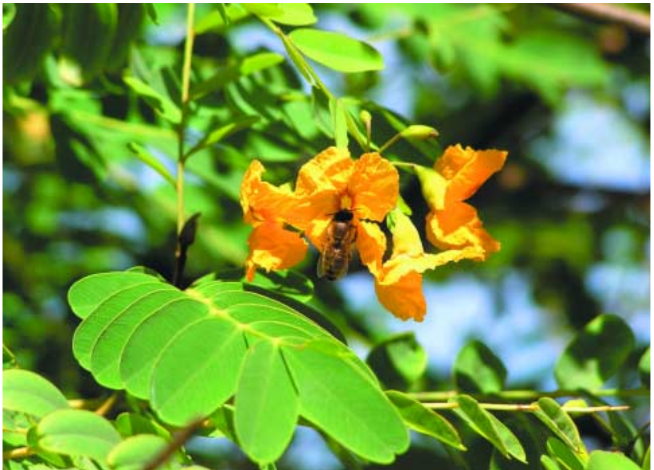
The flowers of rosewood are pollinated by bees.

In its native range in South America the plant grows in a subtropical environment, with generally warm temperatures year round. However, rosewood grows well in most conditions, hence its naturalisation and cultivation throughout Australia and many other parts of the world, for example the United States and Africa.