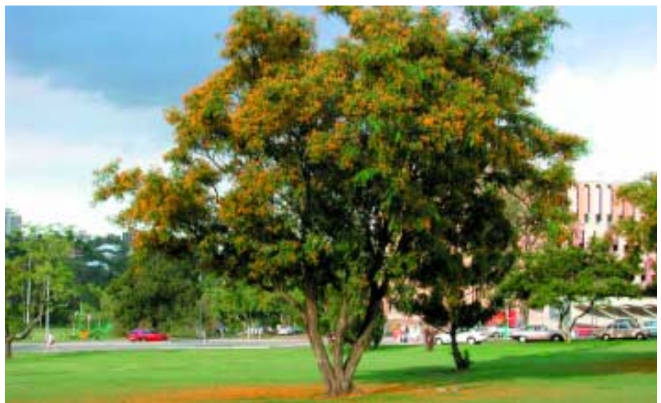
Rosewood has been planted all over the world as an ornamental street tree and garden plant.

Rosewood is a tree growing up to 10 m in height in Australia, with a main trunk and branches forming a distinct elevated