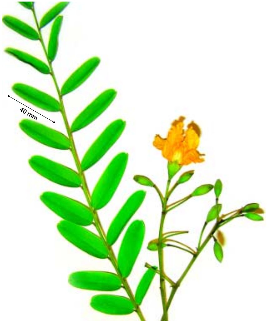
The tips of rosewood leaves are characteristically 'buttock-shaped'.