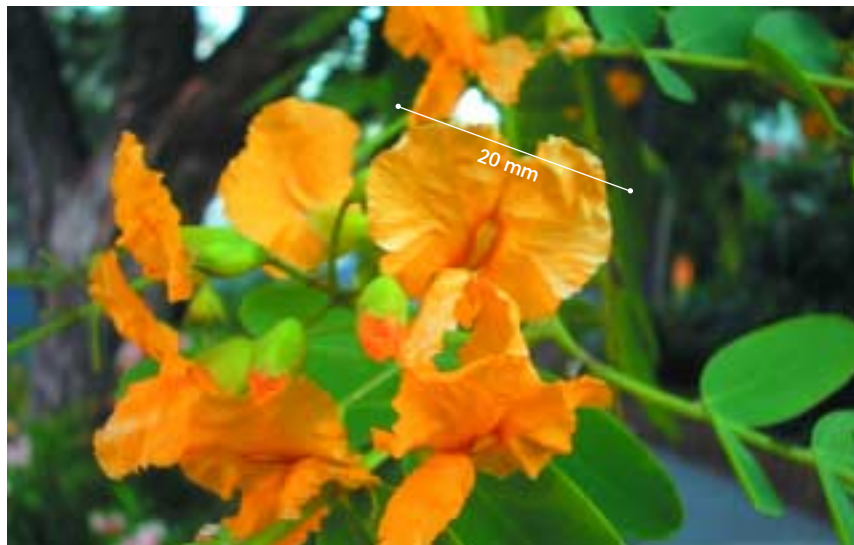
The bright yellow flowers of rosewood occur in leafless racemes (an inflorescence of stalked flowers with the youngest at the top).

Early detection and eradication are also important to prevent infestations of rosewood. Small infestations can be easily eradicated if they are detected early but an ongoing commitment is needed to ensure new infestations do not establish.