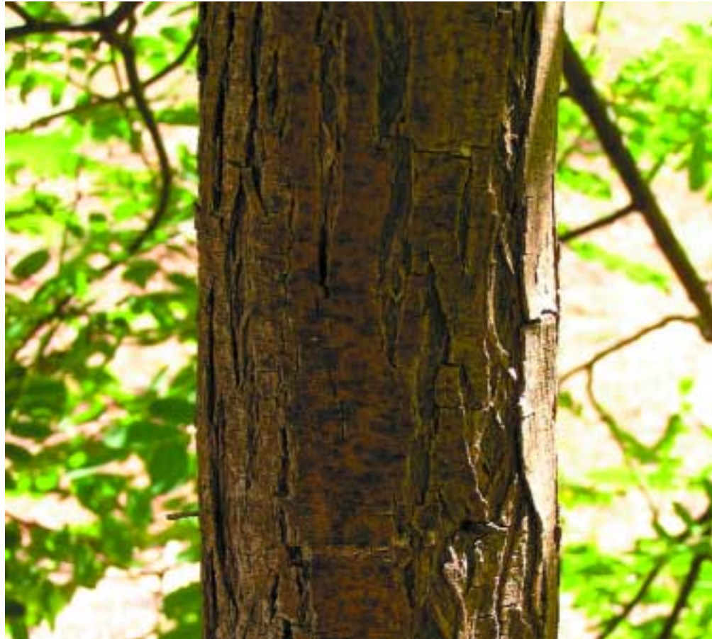
Rosewood has reddish-brown fissured bark.

Rosewood is reported as being invasive, noxious and naturalised in South Africa. With similar climate and soils to South Africa, Australia needs to be concerned with the potential of the tree to become an even more widespread weed than it